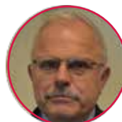
Lembit Rago Secretary-General | Council for International Organizations of Medical Sciences (CIOMS)